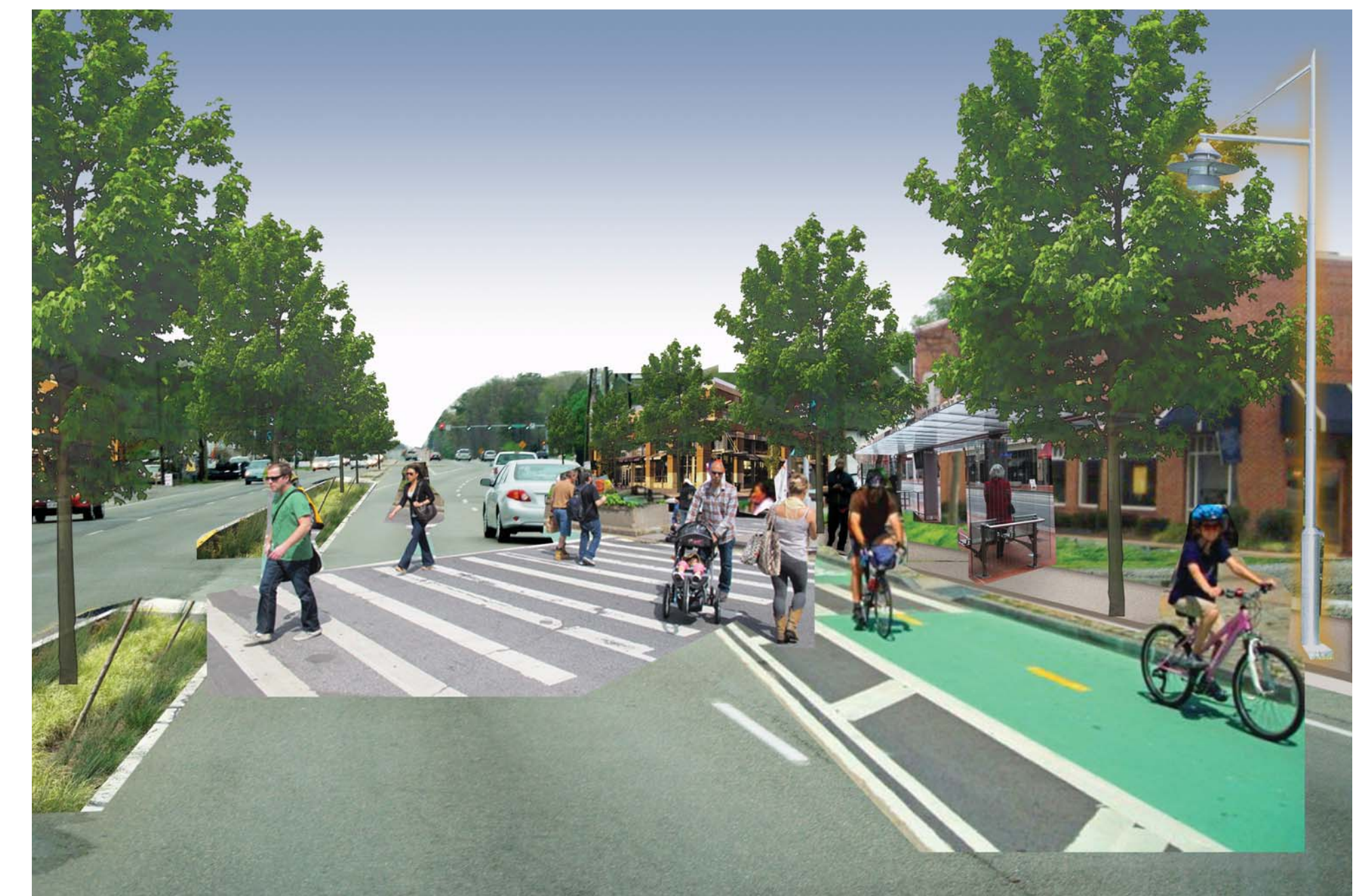
An artist's image of potential corridor improvements.

IF YOU ANSWERED “YES” TO ANY OF THESE QUESTIONS, WE WANT TO HEAR FROM YOU! SHARE YOUR IDEAS ON HOW TO MAKE YOUR LIFE BETTER ON HULL STREET .